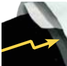
EASY ZIP SYSTEM