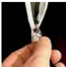
INSERT THE PROTECTIVE SOFT PANEL IN REVERSE ORDER